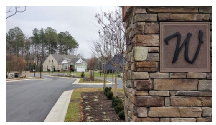
From Route 1: Take Route 9/DE 404 West. Follow 4.6 miles. Make a left on Cool Springs Road. Drive 4 miles to Woodridge on your left.