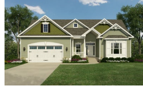
Drake $604,900 1,918 - 2,536 Sq. Ft. 4 BR | 2 BA | 1 STORY