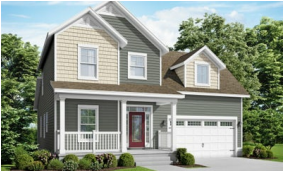
Brenner $622,900 1,975 - 2,489 Sq. Ft. 3 - 4 BR | 2.5 - 3.5 BA | 2 STORY