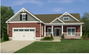
Vandelay $491,900 1,555 - 2,110 Sq. Ft. 3 BR | 2 BA | 1 STORY