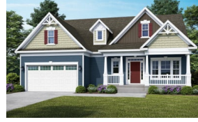
Lloyd $539,900 1,712 - 2,760 Sq. Ft. 3 - 5 BR | 2 - 3 BA | 1 or 2 STORY