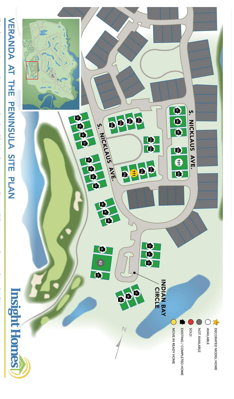
All site plans, community maps and computer generated or enhanced depictions shown are conceptual in nature, which may not accurately represent the actual condition of the item(s) being represented and are subject to change without notice. All buying decisions should be based on visiting and viewing the physical homesite.