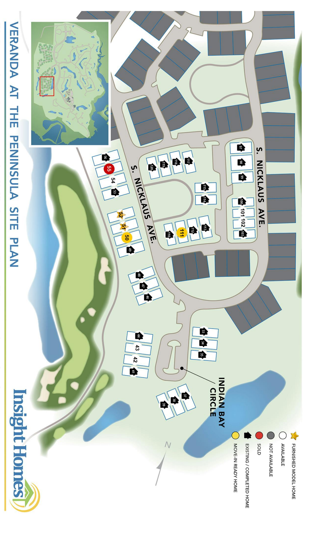
All site plans, community maps and computer generated or enhanced depictions shown are conceptual in nature, which may not accurately represent the actual condition of the item(s) being represented and are subject to change without notice. All buying decisions should be based on visiting and viewing the physical homesite.