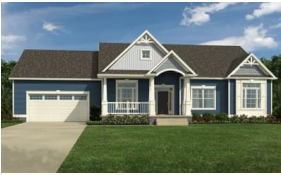
Elaine $483,900 2,181 - 2,603 Sq. Ft. 3 - 4 BR | 2 - 2.5 BA | 1 STORY