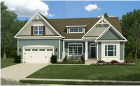
Jerry $475,900 2,140 - 3,401 Sq. Ft. 3 - 6 BR | 2 - 3.5 BA | 1 or 2 STORY