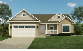
Abbott $407,900 1,284 - 1,722 Sq. Ft. 3 BR | 2 BA | 1 STORY