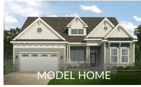
Whatley $470,900 1,979 - 3,590 Sq. Ft. 3 - 6 BR | 2 - 4 BA | 1 or 2 STORY