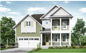
Frank $504,900 2,587 - 3,128 Sq. Ft. 4 - 5 BR | 3 BA | 2 STORY