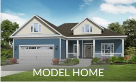
Vandelay $438,900 1,555 - 2,110 Sq. Ft. 3 BR | 2 BA | 1 STORY