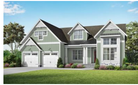
Nelson $503,900 2,405 - 3,941 Sq. Ft. 3 - 5 BR | 2 - 3.5 BA | 1 or 2 STORY