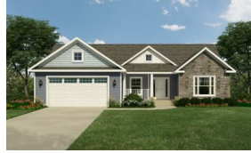
Drake $467,900 1,918 - 2,536 Sq. Ft. 4 BR | 2 BA | 1 STORY