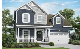
Brenner $481,900 1,975 - 2,489 Sq. Ft. 3 - 4 BR | 2.5 - 3.5 BA | 2 STORY