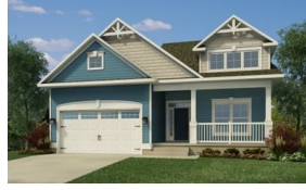
George $435,900 1,514 - 2,920 Sq. Ft. 3 - 4 BR | 2 - 3 BA | 1 or 2 STORY