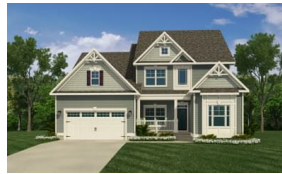
Peterman $555,900 3,122 - 3,735 Sq. Ft. 4 - 7 BR | 3 - 4 BA | 2 STORY