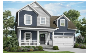
Brenner $431,900 1,975 - 2,489 Sq. Ft. 3 - 4 BR | 2.5 - 3.5 BA | 2 STORY