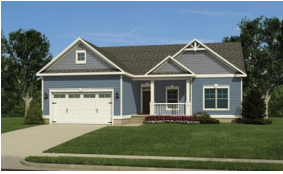
Abbott $359,900 1,284 - 1,722 Sq. Ft. 3 BR | 2 BA | 1 STORY

7445 Ship Builders Drive, Seaford, DE 19973