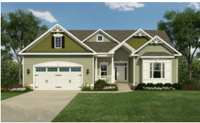
Drake $429,900 1,918 - 2,536 Sq. Ft. 4 BR | 2 BA | 1 STORY