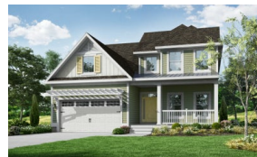
Frank $453,900 2,572 - 3,010 Sq. Ft. 4 - 5 BR | 3 BA | 2 STORY