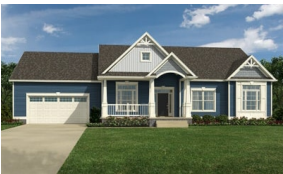
Elaine $434,900 2,181 - 2,603 Sq. Ft. 3 - 4 BR | 2 - 2.5 BA | 1 STORY