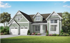
Nelson $451,900 2,405 - 3,941 Sq. Ft. 3 - 5 BR | 2 - 3.5 BA | 1 or 2 STORY