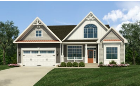
Cartwright $420,900 1,821 - 3,817 Sq. Ft. 3 - 5 BR | 2 - 3.5 BA | 1 or 2 STORY