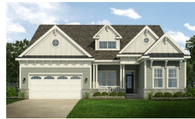
Whatley $425,900 1,979 - 3,590 Sq. Ft. 3 - 6 BR | 2 - 4 BA | 1 or 2 STORY