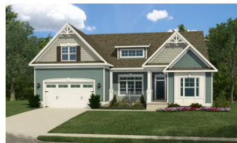
Jerry $421,500 2,140 - 3,401 Sq. Ft. 3 - 6 BR | 2 - 3.5 BA | 1 or 2 STORY