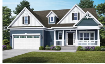
Lloyd $384,500 1,712 - 2,760 Sq. Ft. 3 - 5 BR | 2 - 3 BA | 1 or 2 STORY