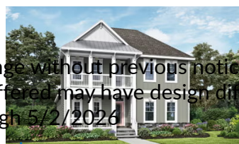
Lukner $533,600 2,555 - 2,675 Sq. Ft. 3 BR | 2.5 BA | 2 STORY

Features, homes and pricing are subject to change without previous notice. Home designs are artist renderings and some homes offered may have design differences. Prices good through 5/2/2026