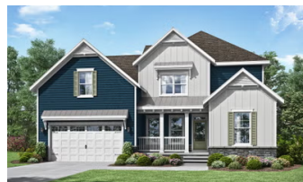
Peterman II $519,900 3,145 - 3,735 Sq. Ft. 4 - 6 BR | 3 - 4 BA | 2 STORY