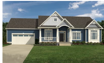
Elaine $409,200 2,181 - 2,603 Sq. Ft. 3 - 4 BR | 2 - 2.5 BA | 1 STORY