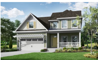
Frank $425,500 $444,300 2,572 - 3,010 Sq. Ft. 4 - 5 BR | 3 BA | 2 STORY