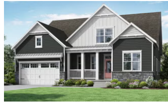
Cartwright $400,100 1,821 - 3,817 Sq. Ft. 3 - 5 BR | 2 - 3.5 BA | 1 or 2 STORY