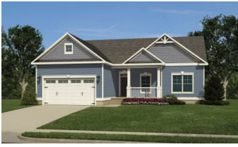
Abbott $334,900 1,284 - 1,722 Sq. Ft. 3 BR | 2 BA | 1 STORY

Build On Your Lot, Select Counties, MD 21801