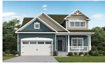
George $357,200 1,514 - 2,920 Sq. Ft. 3 - 4 BR | 2 - 3 BA | 1 or 2 STORY