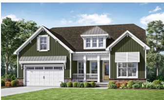
Whatley $410,600 1,979 - 3,590 Sq. Ft. 3 - 6 BR | 2 - 4 BA | 1 or 2 STORY