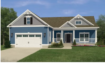
Vandelay $362,400 1,555 - 2,110 Sq. Ft. 3 BR | 2 BA | 1 STORY