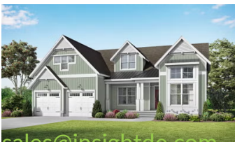
Nelson $448,900 2,405 - 3,941 Sq. Ft. 3 - 5 BR | 2 - 3.5 BA | 1 or 2 STORY