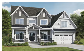
Reston $446,500 $476,300 2,484 - 3,266 Sq. Ft. 3 - 6 BR | 2.5 - 3.5 BA | 2 STORY