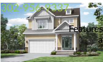
Morgan $533,400 2,501 - 2,728 Sq. Ft. 3 BR | 3.5 BA | 2 STORY