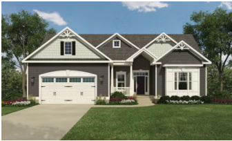
Drake $389,800 1,918 - 2,536 Sq. Ft. 4 BR | 2 BA | 1 STORY