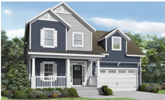
Brenner $406,500 1,975 - 2,489 Sq. Ft. 3 - 4 BR | 2.5 - 3.5 BA | 2 STORY